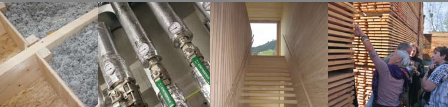
Cover: communal building St. Gerold/A